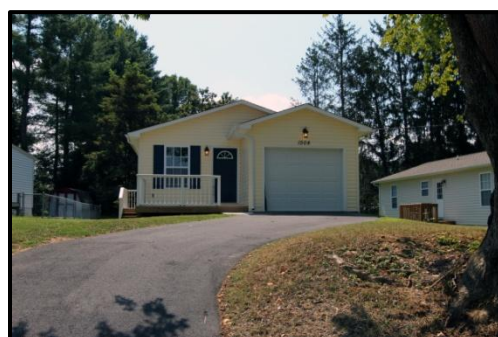
1504 Garden Rd. 1008+/- Sq. Ft.

Directions: In Elizabethton from West G Street turn onto Parkway Blvd. then left on Garden Rd houses on right. Watch for signs.