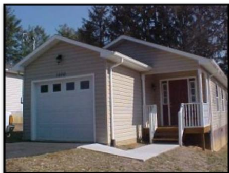
1500 Garden Rd. 848 Sq. Ft.