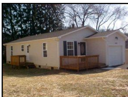
1502 Garden Rd. 984+/- Sq. Ft.